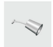
Scleral Depressor (OPTIONAL)