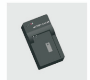
Battery Charger (OPTIONAL)