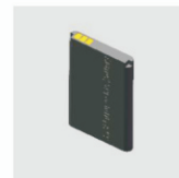
Li-ion Battery (Rechargeable)